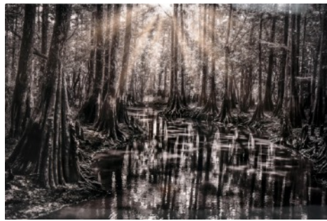
Outstanding Photography Award James Englebrecht "Shining Cypress Swamp"