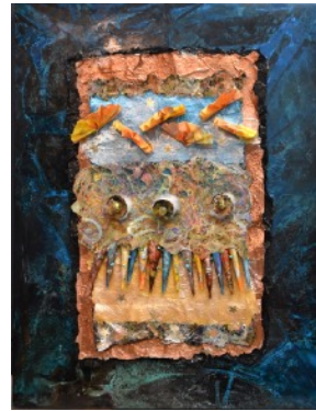
Abstract/ Non-Objective Award Peggy Banks "Luminescence"