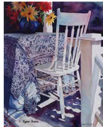
(left) Lynn Ferris award-winning watercolor "Morning Light"

We are now working on next season's 2019-2020 Workshop schedule.