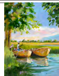
"Two Boats" (acrylic)

Dates: Thursday, February 26 thru Saturday, February 28, 2015 Fees: : AWI Members: $225; non-members: $255