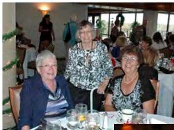
Various members celebrate the holiday spirit with friends at their tables!