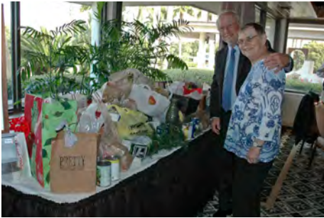
Artist Workshop members came through again this year with their generous donations for the local food pantry.