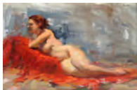
STACY BARTER "Figures and Floral Still Life" Feb 13-15, 2015