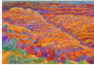
SLOANE KEATS "Transform Beyond the Paintbrush - Palette Knife in Oils" Oct 23-25, 2014