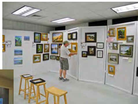
The Artists' Workshop studios were transformed into the Canaveral Seashore Plein Air Wet Gallery during the October 6-11 Paint Out.