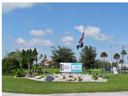
Some exciting developments are being planned for the Barracuda Blvd site. (Update at November Meeting.)

The annual Canaveral Paint Out was again held at the Artists' Workshop Studios October 6-11. Many attended the Wet Gallery set up for the week in the studios for the 26 Plein Air Artists. The Saturday Evening Gala attracted over 250 guests including the artists. Special thanks to all who helped during the week and for the adjustments made to accommodate this great NSB community event.