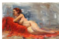
STACY BARTER "Figures and Floral Still Life" Feb 13-15, 2015