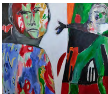
"The Presenter" (acrylic) Harold Garde

November 6, 7, & 8, 2014, by Harold Garde