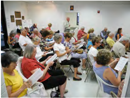
We had a great turnout at the first member meeting of the season, Sept. 3rd. Members review the many classes offered in the new 2014-2015 Classes Brochure.