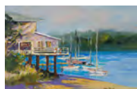
JANE SLIVKA "The Freedom of Acrylics" Feb 26-28, 2015