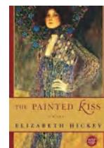
"The Painted Kiss"