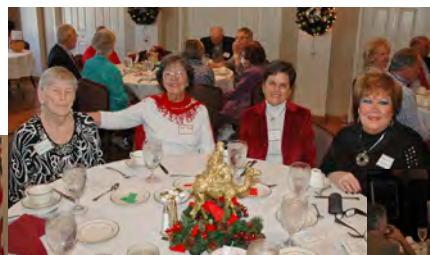
Various other members celebrate the holiday spirit with friends at their tables!