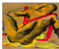
CATHERINE MERRILL "Celebrating the Figure: Drawing on Clay and Paper" Feb 1-2, 8-9, 2014 (Discount date: Dec 18, 2013)