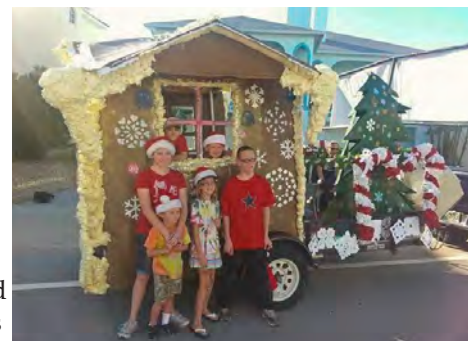
Art Is...Creation's Ginger Bread House Float created by the Young Artists from the A.S.A.P (After School Art Program) Most amazing float in the Christmas parade. Our biggest recycle project ever.

Consider Art is...Creation for your end of year tax deductible donations. This will give us the opportunity to extend scholarships to children and youth who need financial assistance. Thank you for your heart for Youth in the Arts.