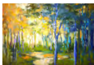
LYN ASSELTA "Expressive Landscapes in Pastel" Apr 4-6, 2014