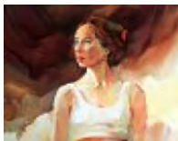
JANET ROGERS "Expressive Watercolors with Faces & Figures" Mar 25-27, 2014