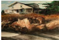
STEVEN HARDOCK "Watercolor Magic" Nov 29-30, & Dec 1, 2013

Plan ahead and mail your check early to receive a 20% workshop discount. It must be postmarked 45 days before the workshop begins. (NO EXCEPTIONS)