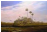
SCOTT HIESTAND "Acrylic Landscape Painting" Feb 19-21, 2014