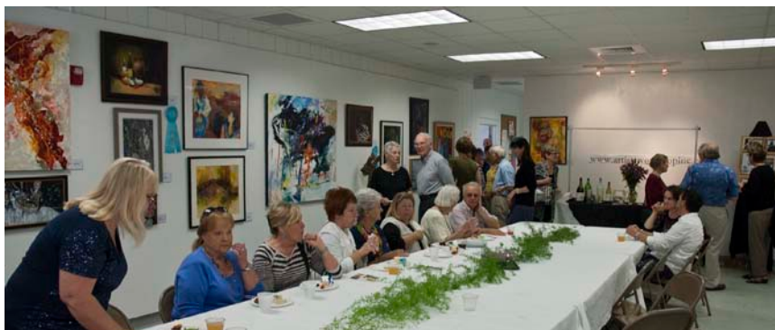
Crowds converge as Studio B is transformed into a fine gallery and reception center.