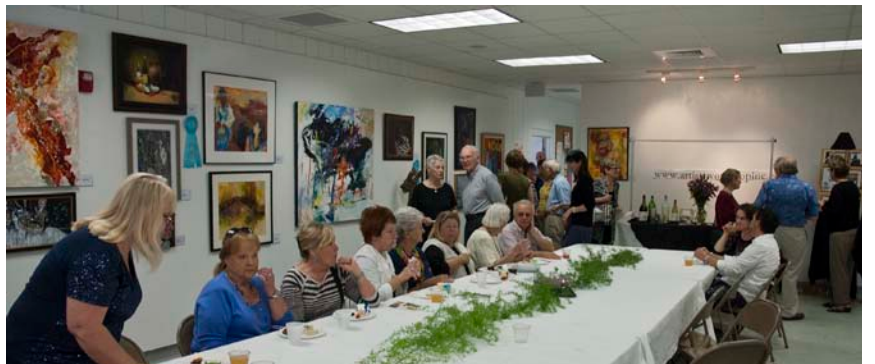
Crowds converge as Studio B is transformed into a fine gallery and reception center.