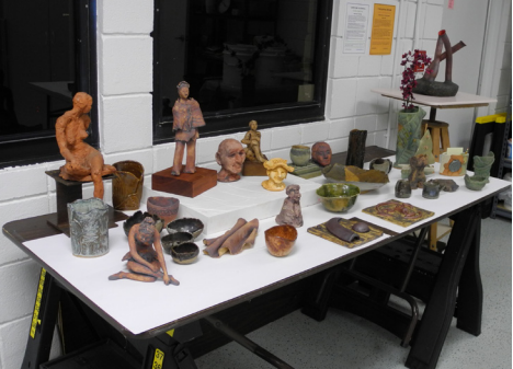
Sample works from Clay Sculpture and Ceramics classes