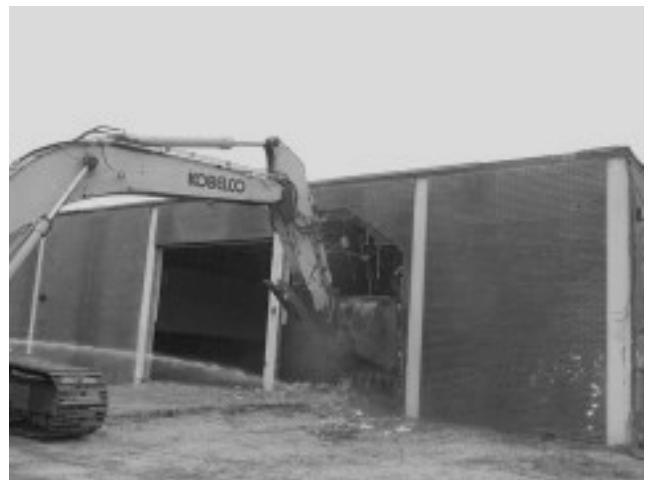
The demolition begins....