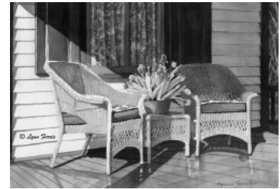
Two in the Afternoon